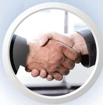
Powerful Global Partnerships