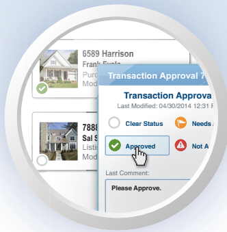
Software Built for International Real Estate