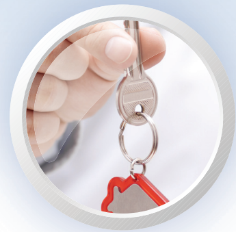
Close More Business Quicker

ziplogix™ is a partner of the United States National Association of REALTORS® with currently over 600,000 US REALTOR® users. International real estate professionals using zipForm® Plus can efficiently fill, print, fax, e-mail and e-sign forms and contracts. We invite real estate organizations, franchises and companies across the globe to partner with ziplogix to offer their real estate professionals the experience of a simplified transaction process.